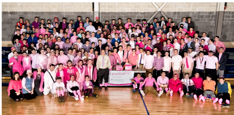
Photo from Pink Day 2015