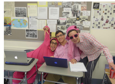
Photo from Pink Day 2015

Parents are welcome to join us at 9:30 AM in the Beit Knesset and to select one of these sessions.